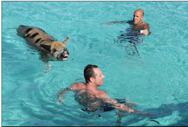
Four C's Adventures passengers swim with the pigs.

Four C's offers fishing and snorkeling trips, wild nature tours, half-day adventures and full-day adventures. By far the most popular tour is the full-day adventure that carries passengers north from the settlement of Barrettarrie throughout the cays, Capt. Pat said. Usually the tour extends as far as Compass Cay and sometimes into the Exuma Land and Sea Park.